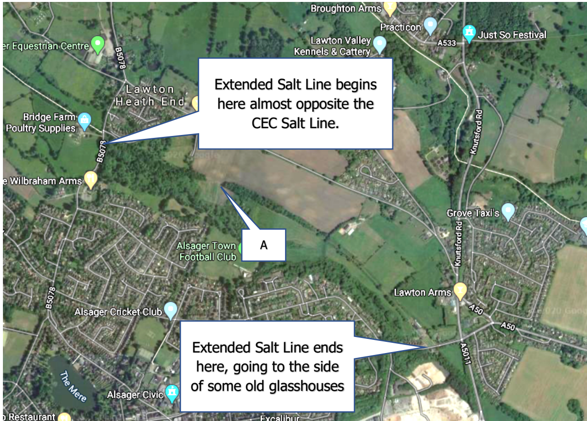
The above is the aerial view. A PRow crosses at point A.