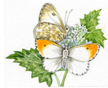
Orange-tip butterfly Stella Stilwell Sandbach Woodland and Wildlife Group

Sandbach Footpath Group Aiming to protect, improve, extend and make accessible the network of footpaths in and around Sandbach.